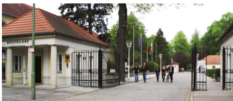
The Federal Academy for Security Policy's open campus within the Schönhausen Palace grounds in the Pankow district of Berlin

Policywise, the Federal Academy is managed by a Board of Trustees chaired by the Federal Chancellor and composed of delegates from all the ministries represented in the Federal Security Council. The Board of Trustees is supported by an Advisory Board consisting of several key figures in security policy. Organisationwise, the Academy is in the remit of the Federal Ministry of Defence.