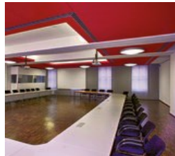
The Academy's "BERLIN" building and one of its rooms, equipped with up-to-date conference and event equipment..